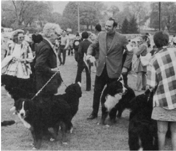
Figure 11. A group outside the ring at a supported entry in Pennsylvania, 1974.

matches led the AKC to grant the Club "licensed" status, which meant that specialty shows could be held. Since the first National Specialty in 1976, these annual events have played an important part in the activities of the Club.