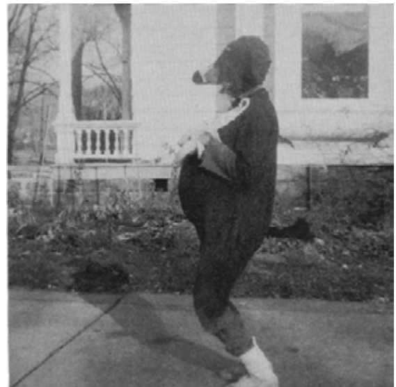
Figure 9. Unidentified ?Bernese Mountain Dog in Eau Claire, Wisconsin, 1960.