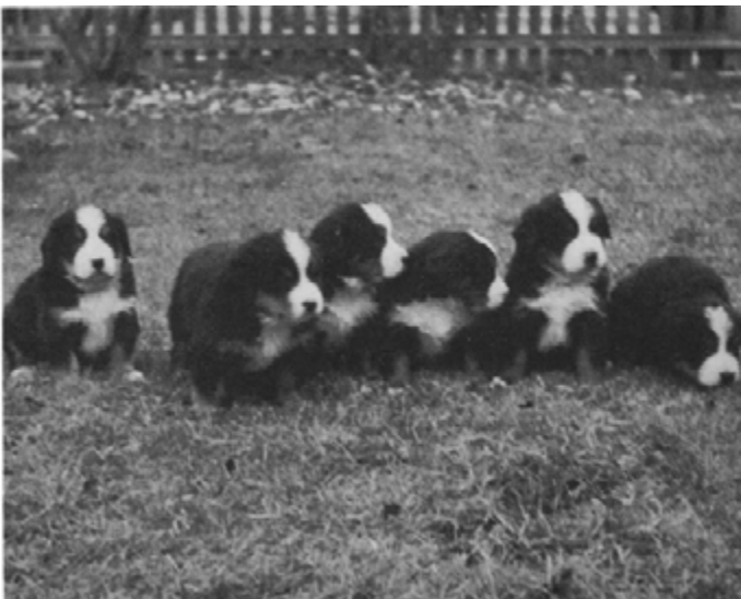
Figure 12. That was an interesting 50 years. Now on to the future.