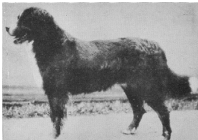
Figure 6. Ajax vom Bucheggberg, a well known dog featured in the 1947 edition of the AKC's "Complete Dog Book."