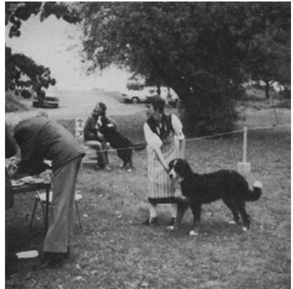
Figure 10. Junior showmanship class at a club sponsored match in 1975.

Objective d). To protect and advance the interests of the breed and encourage sportsmanlike competition at dog shows. This includes the encouragement of active participation in dog shows. One of the first projects of the Club after its formation was to write a Code of Ethics that must be signed by all wishing to enter the Club. The Code addresses breeding practices and encourages breeders to exercise great care in all aspects of this important activity. It specifies that good sportsmanship is required not only in competitions but in all activities related to the dogs and the Club.