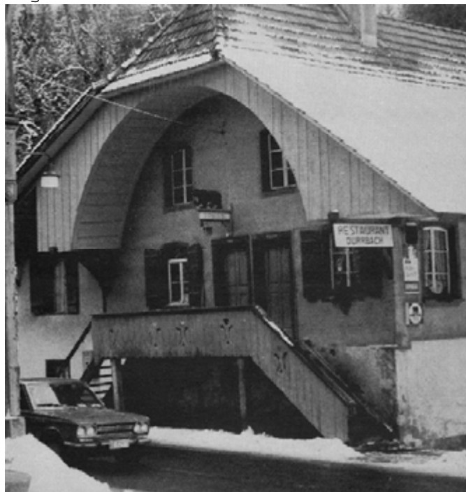
Figure 4. The hotel at Dürrbach where early Dürrbächler fanciers gathered.