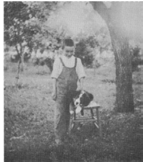
Figure 5. Is this a Bernese puppy in this photo from turn-of-the-century Nebraska?