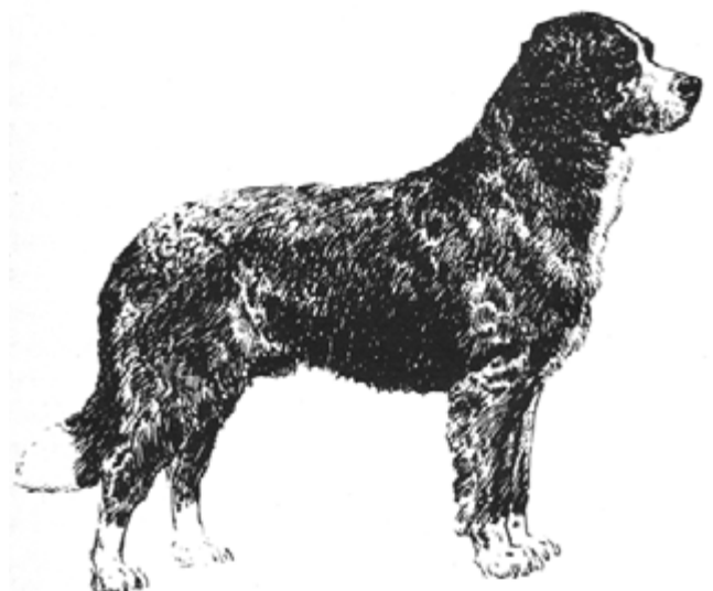
Figure 13. Drawing by Paul Brown, done around 1950 (from Miller).