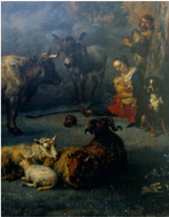
Figure 2. Detail from a painting by Potter (1651) showing a dog resembling the Bernese of today (from Räber, 1984)

Both Albert Heim, an early promoter of Swiss farmers' dogs, and later Hans Räber, editor of Hundesport , the official publication of the Swiss Kennel Club, turned to old paintings in attempts to trace the background of these dogs. Most paintings were done of the lap dogs and hunting companions of the rich and noble, but a few clues to the background of the Sennenhunde were found. One painting dating to 1651 by the Dutch painter Paulus Potter shows a large tricolored dog that could easily be a Bernese Mountain Dog.